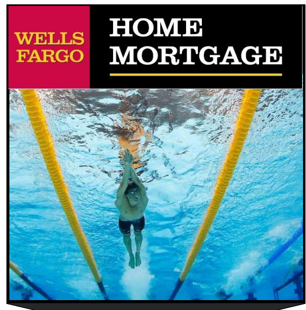
Video with Sponsors